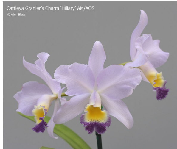
Cattleya Granier's Charm 'Hillary' AM/AOS

- I use Photoshop software to crop and adjust the brightness, contrast, & sharpness of the pictures.