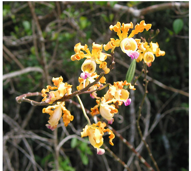
Schomburgkia brysiانا(?) flowers