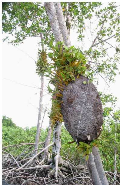
A huge Schomburgkia and termite nest