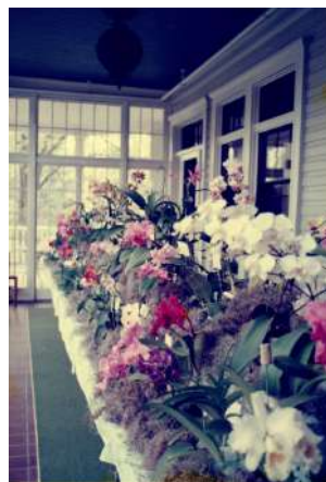
Bloemendaal HS Show '88