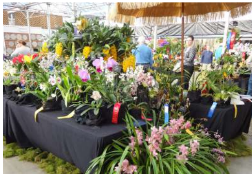
Charlottesville Orchid Society Display