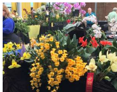
Floradise Orchids Display