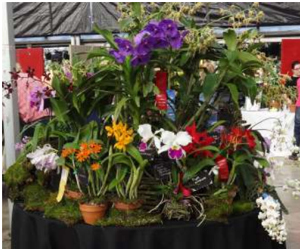
Chadwick & Son Display