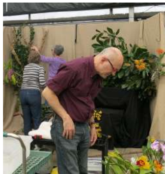
Working the VOS Show