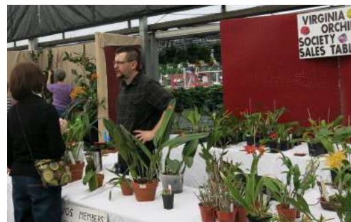
VOS Members Sales Table